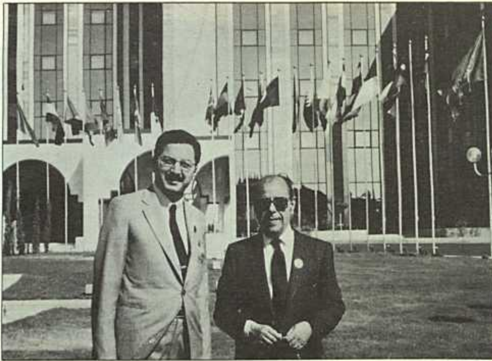
H.E. Mr. Habib Chatty, Secretary General of the O.I.C. With the Director - General of the Centre (3rd Summit, Taif)

The 1981/82 calendar year was a year of hectic activities for the Director General. His personal diplomacy has contributed a lot in creating new contacts in the member countries of the OIC while at the same time strengthening the old ones. These connections have proved very useful in solving many problems and were instrumental to promote stronger ties between the Centre and their countries. A brief resume of the meetings, conferences, etc., that he attended and the countries visited are detailed below: