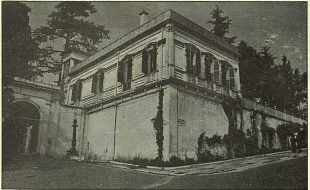
A view of the Present Premises of the Centre.

The proposal for the establishment of a research Centre for Islamic History, Art and Culture at Istanbul was mooted by the Turkish delegation at the 7th Islamic Conference of Foreign Ministers convened in Turkey in 1976. The proposal was accepted in principle and the Turkish Government was requested to submit a detailed report on the subject. The venue of the proposed Centre - Istanbul - was also agreed on due to its being the repository of a great Islamic culture and civilization. The consequent report prepared by the Turkish Government was considered at the 8th ICFM held at Tripoli (Libya) on 16-22 May 1977 where it was also decided to start consultations with the Islamic Solidarity Fund with a view to seeking its assistance in funding the Centre. The legal form and the establishment statute of the Centre was approved at the 9th ICFM held at Dakar in 1978. The first programme and the budget of the Centre were formally approved at the 11th ICFM held at Islamabad in May 1980. In the 12th ICFM held at Baghdad