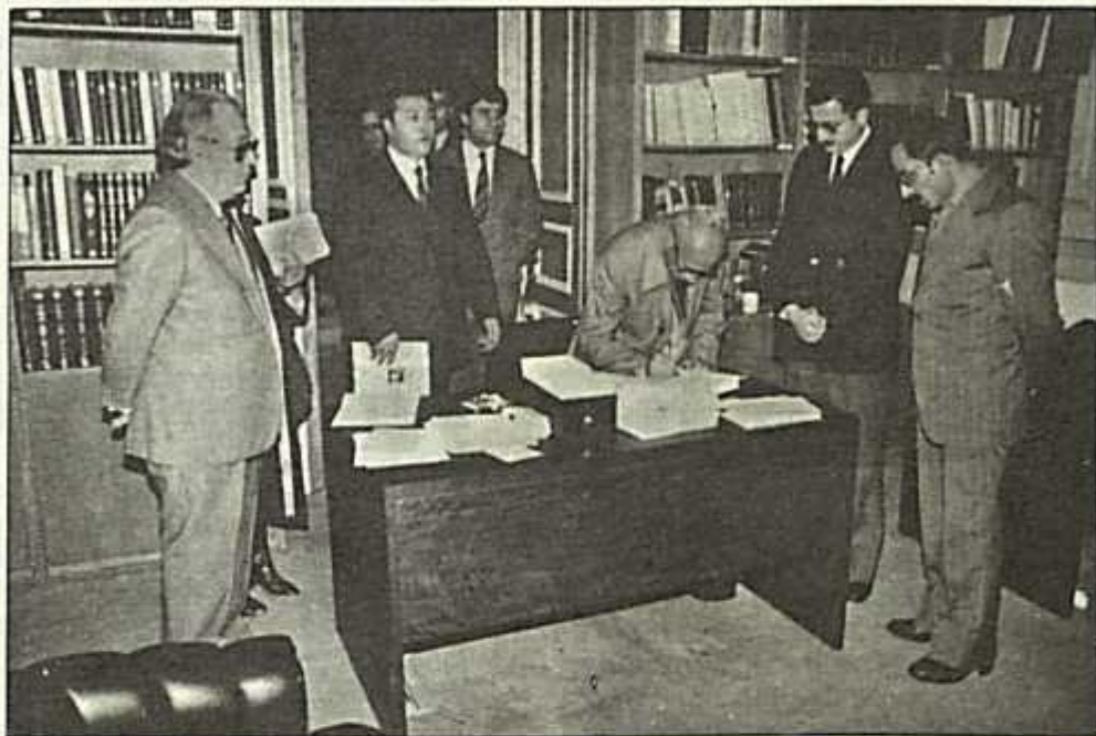
H.E. Mr. Bülend Ulusu, Prime Minister of Turkey in the emerging Library of the Centre.

Libraries are essential and indispensable information centres that are prerequisite in every field of research. It can easily be said that the credibility of a research or an academic study is correlated to the information centre.