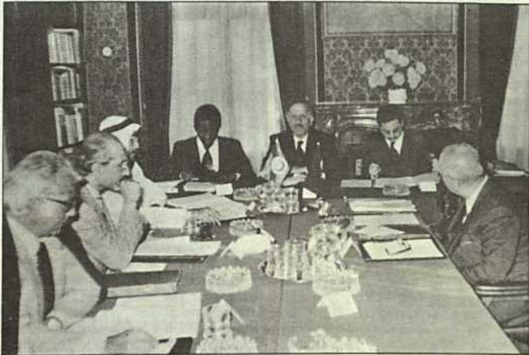
A view of the First meeting of the Governing Council of the Centre.

The Director General of the Centre and the