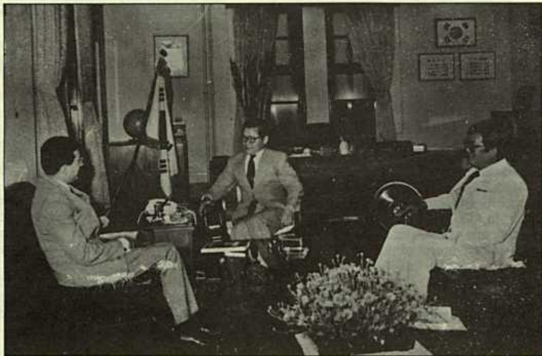
Dr. Ekmeleddin Ihsanoğlu, Director General of the Centre in audience with Vice-Minister of Foreign Affairs of South Korea, during his visit to South Korea in connection with the opening ceremony of the third mosque in Seoul.