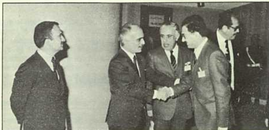
The Director General, Dr. Ekmeleddin İhsanoğlu in audience with H.M. King Hussain and H.R.H. Crown Prince Hasan of Jordan.

The Libyan History Studies Centre, Tripoli will hold a conference in Tripoli, from the 18th through 23rd October 1982 on the "Decolonisation of the History of the Turkish-Arab Relations". A wide range of interesting and thought-provoking topics are expected to be dilated upon under the above-mentioned main theme of the Conference. Further