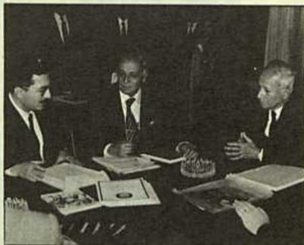
H.E. Mr. Bülend Ulusu, Prime Minister of Turkey with the Director General of the Centre