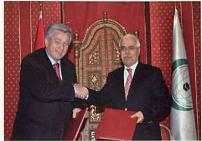
A cooperation protocol was signed between IRCICA and MANU