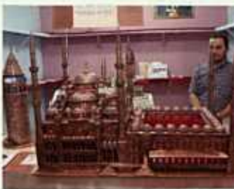
Ensoy Abut, Turkey, 1 st Award