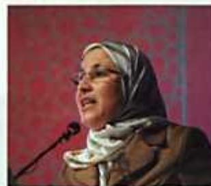
Ms. Bassima Hakkaoui, Minister of Solidarity, Woman, Family and Social Development of Morocco