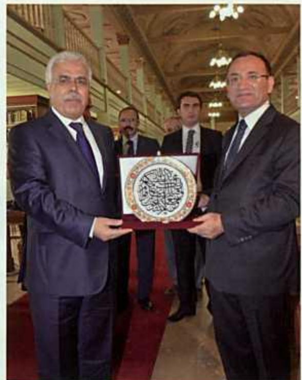
Mr. Bekir Bozdağ was presented with the motto of IRCICA, a calligraphic work bearing the Quranic verse 13 in Surah al-Hujurat