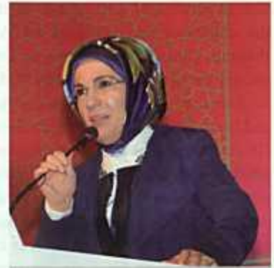
Ms. Emine Erdoğan, spouse of the Prime Minister of Turkey, addressed the opening ceremony