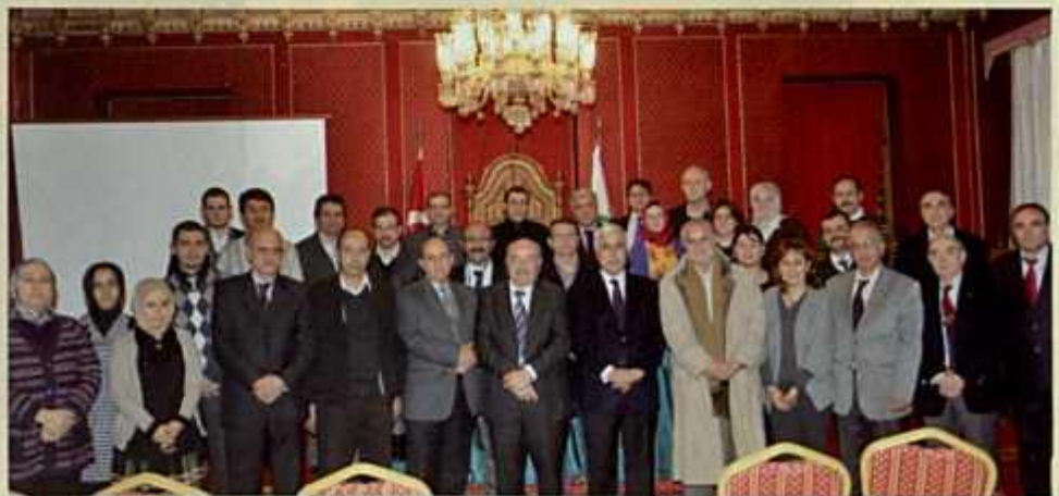
Souvenir photo with the colleagues