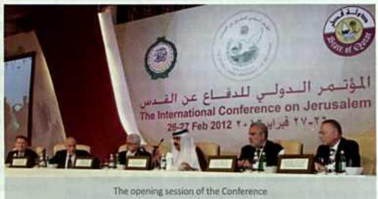
The opening session of the Conference