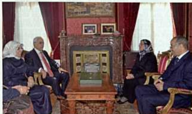
Meeting in the Director General's office