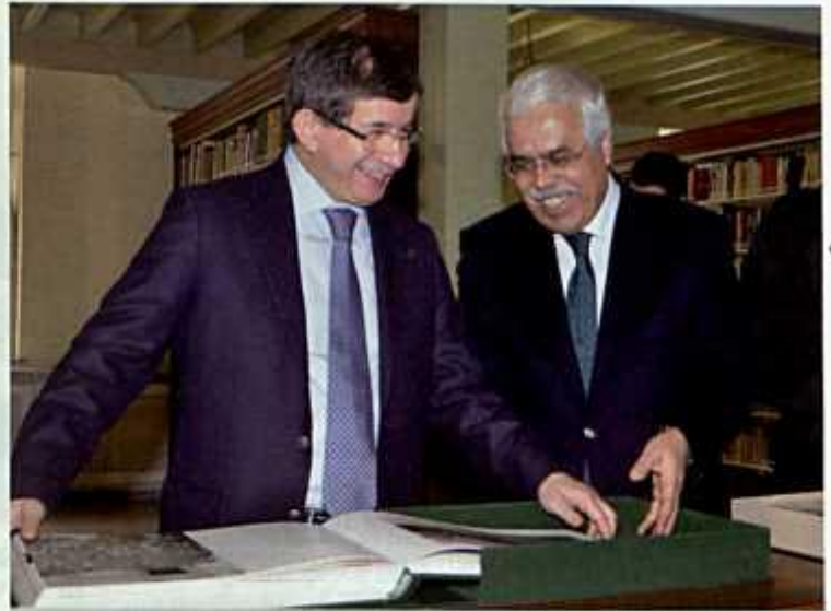
The Minister expressed his appreciation of the Centre's publications

At the end of his visit, Prof. Davutoğlu recorded his impressions in the Visitors Book: "I felt great honour and pleasure to visit IRCICA and the new premises of its library from which I had