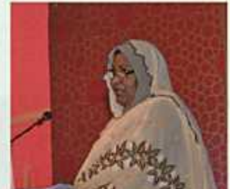
Ms. Khadeega Abdulgassim Hag Hamad, Vice Minister of Social Security of Sudan