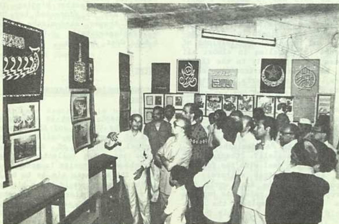
Delegates from Bangladesh at a calligraphy exhibition by the A.I.I.C.

The organiser, All India Institute of Islamic Culture is a non-commercial body endeavouring to "instruct the public and particularly the Muslims, about the 1400 years old heritage of Islam, to present the world-wide traditional and cultural Islamic heritage in its correct beauty and form, to create an understanding between Muslims and other communities regarding Islamic culture and tradition and to develop relative well-being with other sister communities and their culture, so as to encourage national integration and international brotherhood". The address is All India Institute of Islamic Culture, c/o Hamdard Library, 14, Old Bazar, Kirkee, Pune 411003, India.