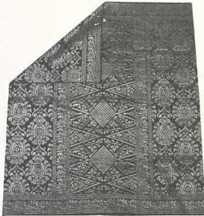
Songket, handloomed with silk and gold thread

with gold thread, known in the Malay world as "Songket". The exhibition was featured on the Turkish television and aroused great interest. Especially groups of students from schools of art and craft visited the exhibition and had the opportunity to learn about this rich tradition of cloth weaving and design. An informative catalogue of the exhibits was also available.