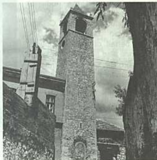
Clock tower, Mostar

The end product of the workshop will be the preparation of an urban restoration plan and methodology of approach for the first stage in the restoration of the Mostar Old Town. This restoration plan and methodology will be used in the actual restoration of Mostar Old Town to be carried out later.