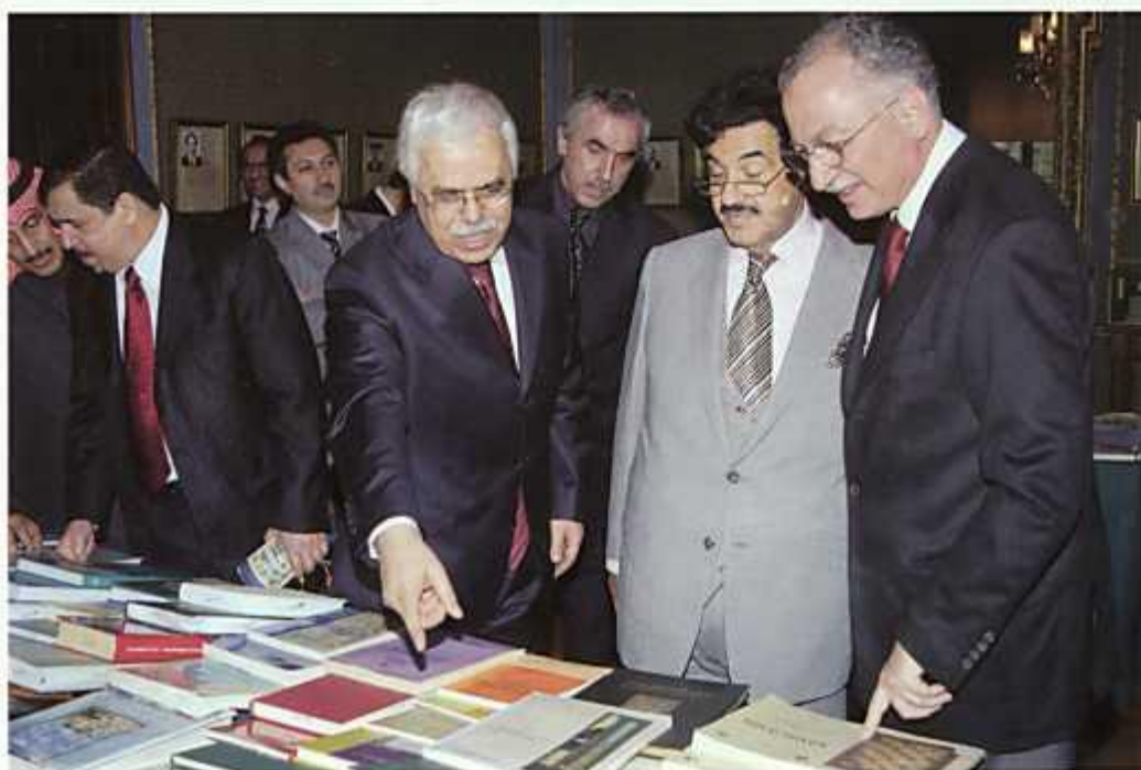
His Highness Sheikh Nasser al-Mohammed al-Ahmed al-Sabah saw an exhibition of publications by IRCICA

H.H. Sheikh Nasser al-Sabah kindly received a plaque of IRCICA expressing the Centre's gratitude to the state of Kuwait which was presented by OIC Secretary General and IRCICA Director General.