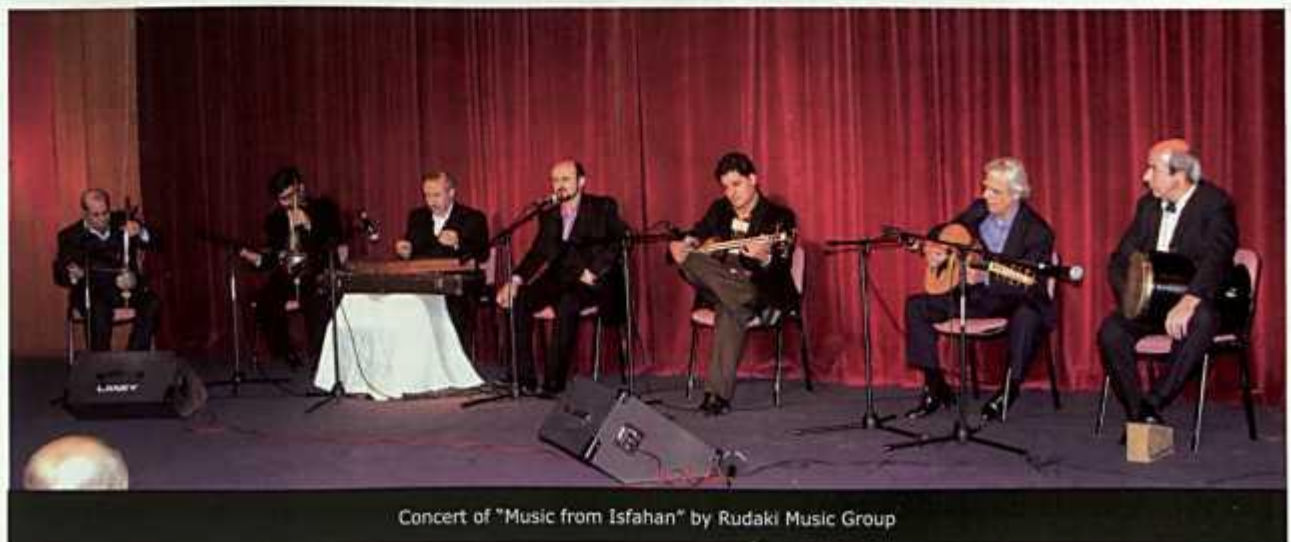
Concert of "Music from Isfahan" by Rudaki Music Group

He said that with the aim of better introducing the cultures and cultural traditions of the Member States to each other's peoples, the Centre will continue to promote activities such as the Isfahan Cultural Week. The Director General