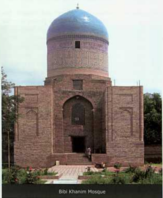
Bibi Khanim Mosque

While explaining the characteristics of these monuments with respect to architectural design and construction, the lecturer also pointed to their respective positions within the city structure. Semerkand is well-known for the remarkable ideas and applications of city-building.