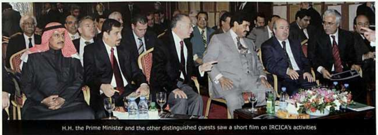
H.H. the Prime Minister and the other distinguished guests saw a short film on IRCICA's activities