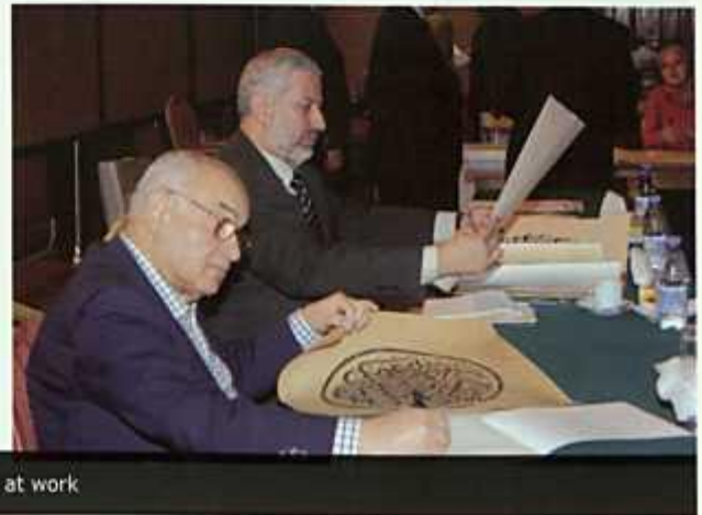
The Jury at work