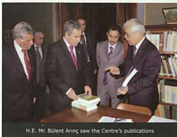
H.E. Mr. Bülent Arınç saw the Centre's publications