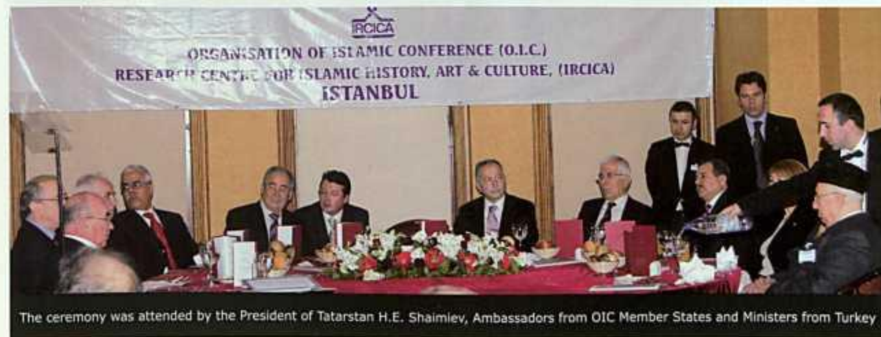
The ceremony was attended by the President of Tatarstan H.E. Shaimiev, Ambassadors from OIC Member States and Ministers from Turkey