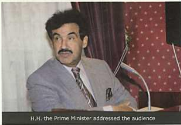
H.H. the Prime Minister addressed the audience