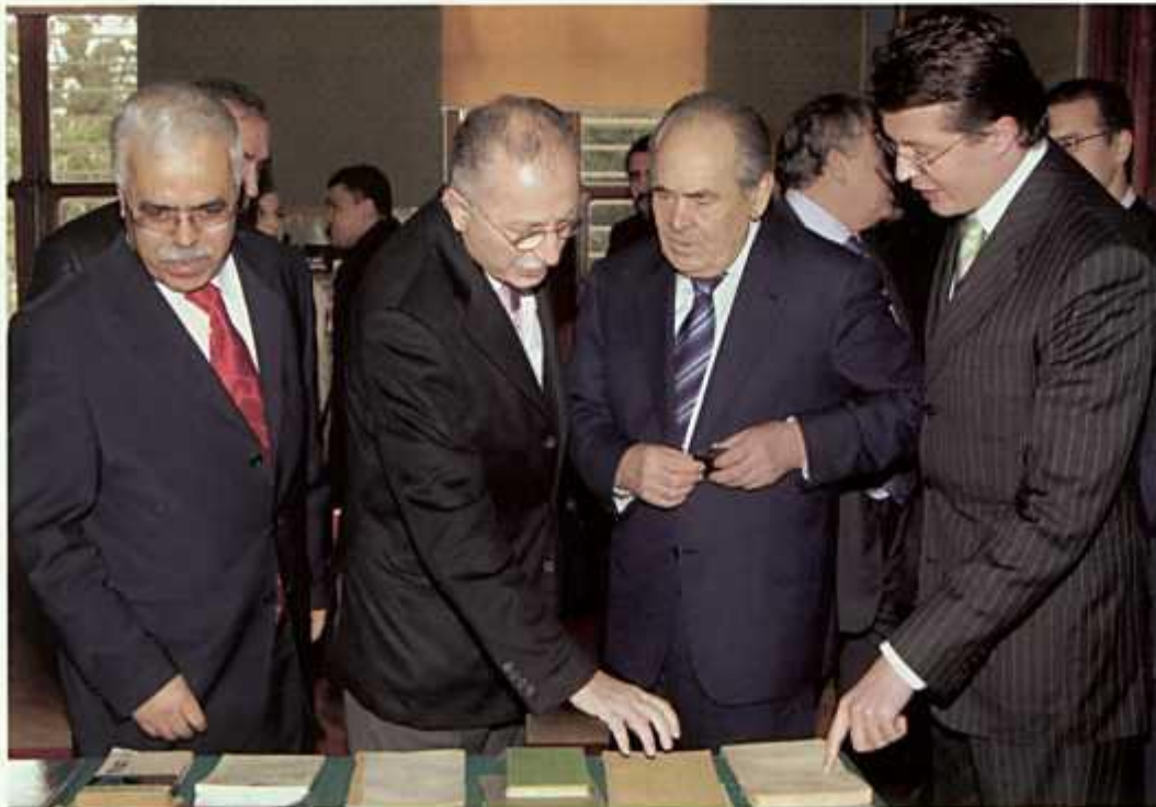
President Shaimiev saw an exhibition of books on Tatarstan selected from IRCICA's Library