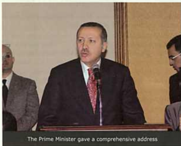
The Prime Minister gave a comprehensive address