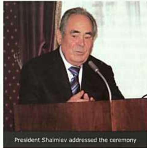
President Shaimiev addressed the ceremony

Tatar society has its freedom; he expressed his belief that in due time its cultural and religious identity will develop in the same positive way their ancestors had but in the modern way, 21st century style. All this was done by President Shaimiev, the leading force behind the development of his country, and this had been recognized by the Muslim world as expressed by the presentation of the King Faisal International Prize for Service to Islam for 2007 to President Shaimiev, for which the Secretary General reiterated his warm congratulations on this occasion.