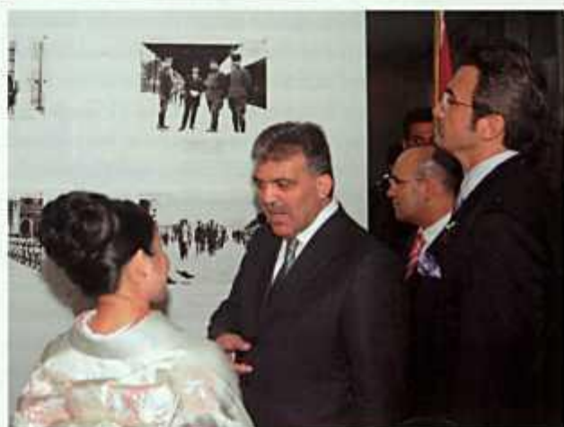
H.E. President Gül opened the exhibition. Then, the President and the accompanying governmental delegation – here with State Ministers Kürşat Tüzmen and Mehmet Şimşek - visited the exhibition together with the Japanese hosts and guests