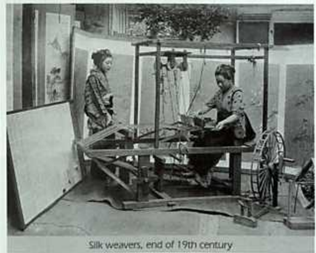
Silk weavers, end of 19th century