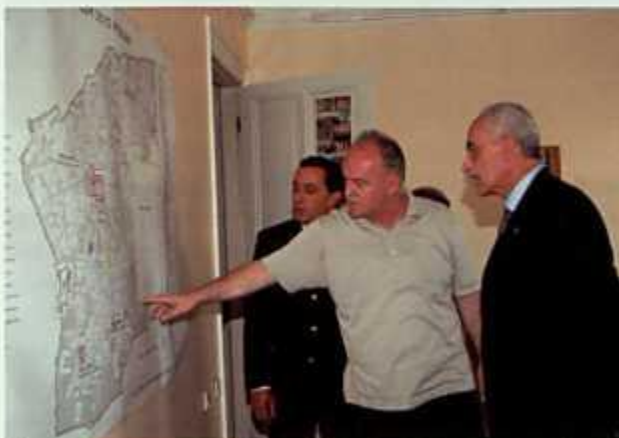
Dr. al-Ashur received information on the Centre's activities relating to the preservation of the architectural heritage of Al-Quds