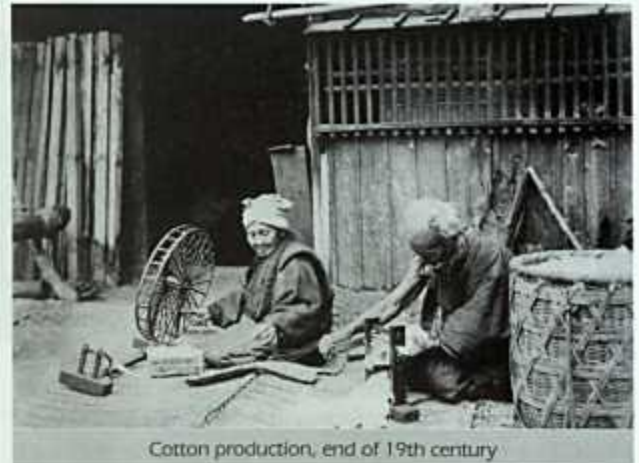
Cotton production, end of 19th century

The catalogue of the Tokyo exhibition has the following sections: Common History (Prince Akihito Komatsu and Princess Yoriko Komatsu's visit to İstanbul- 1887, Ertuğrul Disaster-1890, Japanese cruisers Hiyei and Kongo bringing the survivors of the Ertuğrul disaster to İstanbul- 1891, Japanese military delegation headed by General K. Vada visits İstanbul-1924); Japanese People (end of 19th century), with scenes of social and daily life; Japanese sites and places (c. 1900)