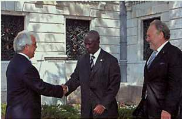
Dr. Eren receives H.E. Mr. Bah, Minister of Foreign Affairs of Guinea, and the Honorary Consul of Guinea in Istanbul Mr. Orhan Argun

IRCICA was honoured to receive at its headquarters H.E. Mr. Amadou Lamarana Bah, Minister of Foreign Affairs of the Republic of Guinea, on 21 August 2008. H.E. the Minister was in Istanbul as part of the Guinean Governmental delegation participating in the Turkish-Africa Cooperation Summit. A documentary film outlining the activities of the Centre was presented to the Minister. He was briefed on the main long-term programs including the congresses on the history of Islamic civilisation in various regions of the world.