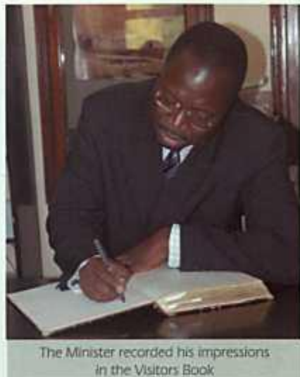
The Minister recorded his impressions in the Visitors Book

talks were followed by a tour to the various departments of IRCICA, where the Minister was briefed on the activities, the researches and publications. H.E. the Minister recorded his impressions in the Centre's Book, as follows: "I feel honoured to have visited this prestigious centre. It is indeed a centre of excellence in Islamic studies and research. I wish the Director, the staff and sponsors Allah's Blessings and Guidance."