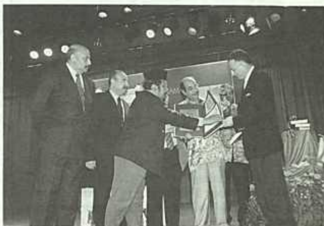
Launching of the Malay version of the Centre's publication The Art of Calligraphy in Islamic Heritage

The twentieth anniversary of IRCICA shall be commemorated in Turkey, the host country where its headquarters are located, with an international ceremony to be held within the framework of the 16 th Session of the OIC's Standing Committee for Economic and Commercial Cooperation (COMCEC) under the Chairmanship of the President of the Republic of Turkey, on 25 October 2000 in Istanbul.