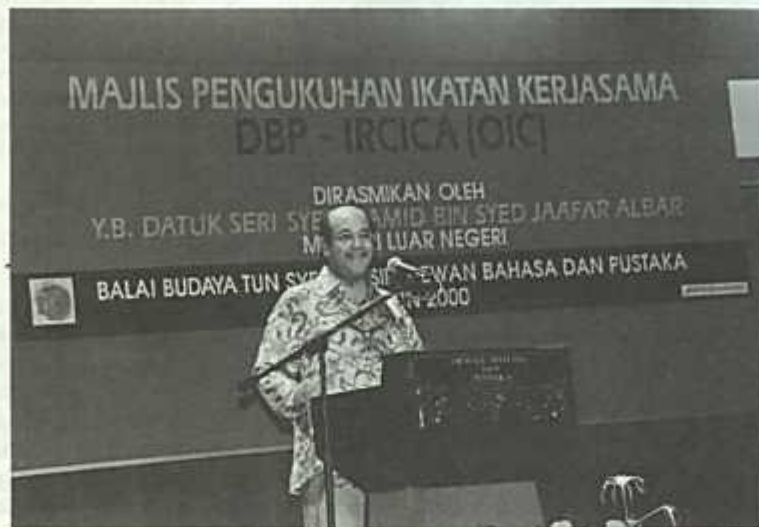
H.E. Datuk Syed Hamid Albar, Minister of Foreign Affairs of Malaysia, delivers his address

The twentieth anniversary commemorated in the Academy of Language and Literature, Kuala Lumpur, Malaysia: IRCICA WEEK 24-30 June 2000