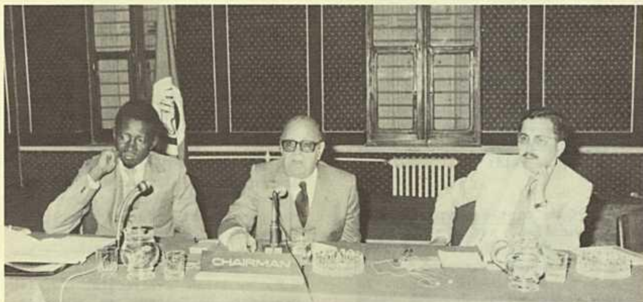
H.E. Mr. Habib Chatty, Secretary General of the O.I.C. presiding over the first meeting of the Heritage Commission.