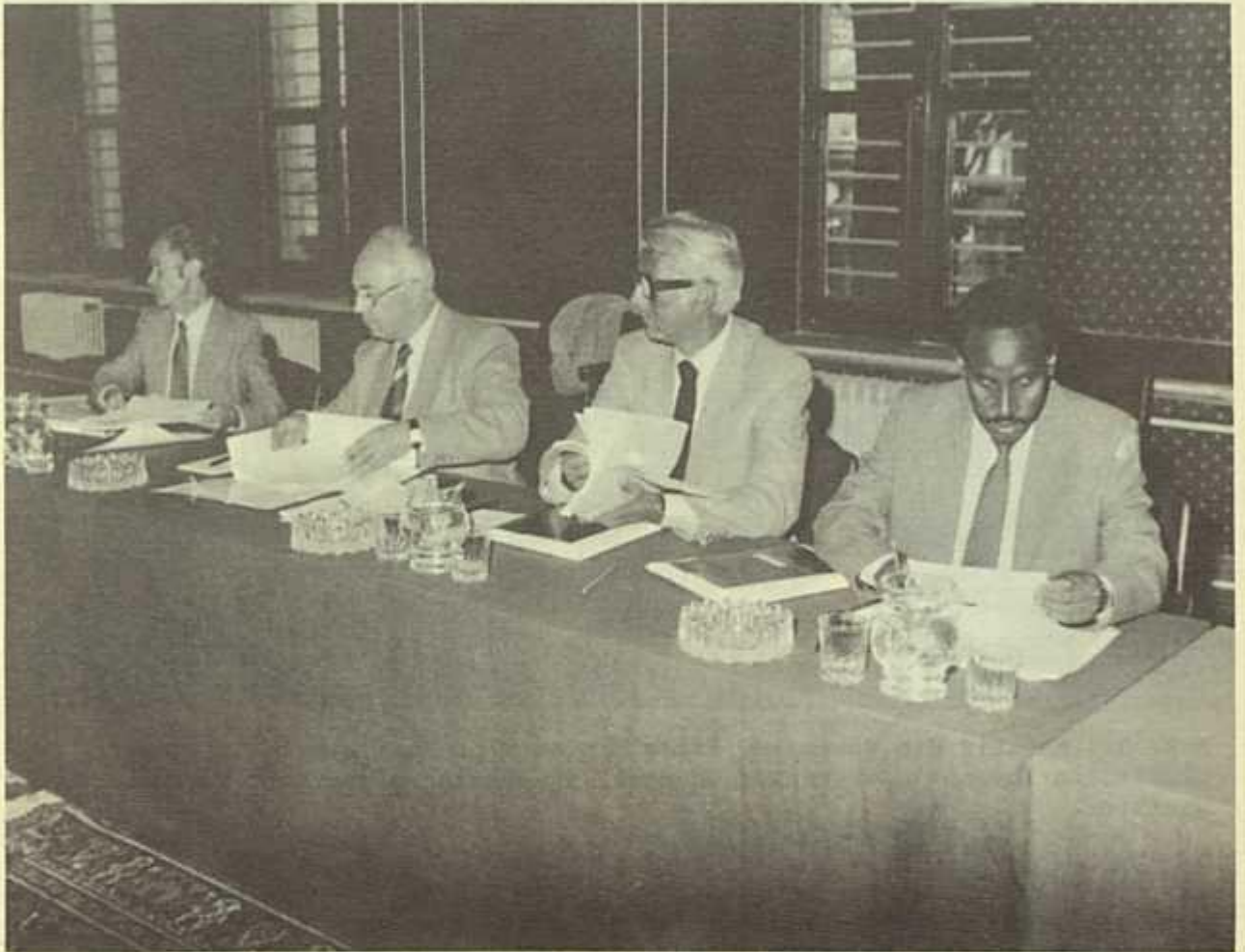
Another view from the 2nd Governing Council Meeting.

Thereafter, he presented the Annual Report of the Centre which was discussed and approved by the Council. The Council also approved the Work Programme for the year 1983/84, Internal Rules and Regulations and the Organisational Chart of the Centre. The Council recommended the establishment of a Fund for special projects to be financed through individuals or organisations. The establishment of a special department for bibliography was also proposed that could collect information on a permanent basis, classify and publish it. The resolution No:5