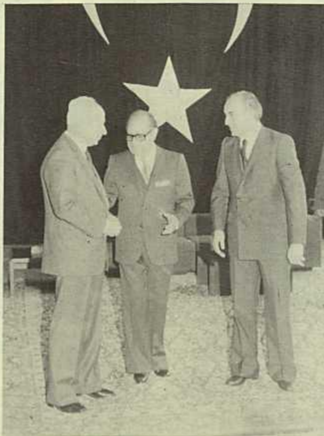
Seen in the picture are: (From left to right )- H.E. Mr. Bülend Ulusu, Prime Minister of Turkey, H.E. Mr. Habib Chatty, Secretary General of O.I.C. and H.E. Mr. İlhan Evliyaoğlu, Minister of Culture and Tourism of Turkey.

And say: "Work (righteousness) soon will Allah observe your work, and His messenger, and the believers; soon will you be brought back to the knower of what is hidden and what is open: Then will He show you the truth of all that you did (QURAN: 9:105)". And true indeed is the word of Allah!