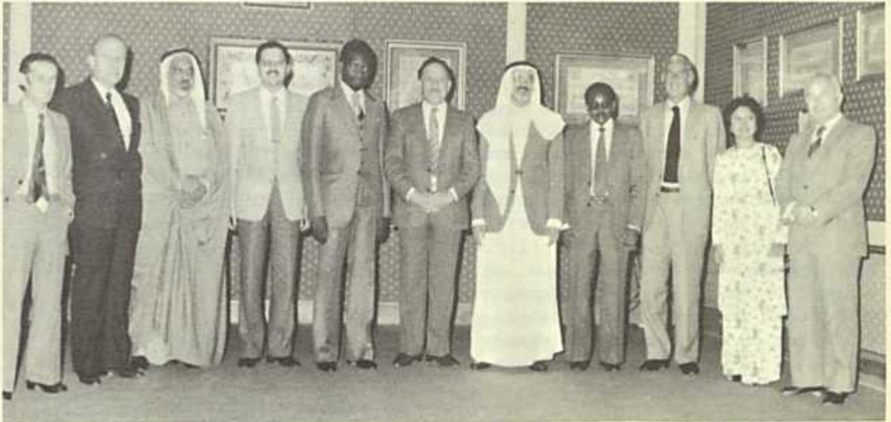
A group photo of the some distinguished members of the Heritage Commission.