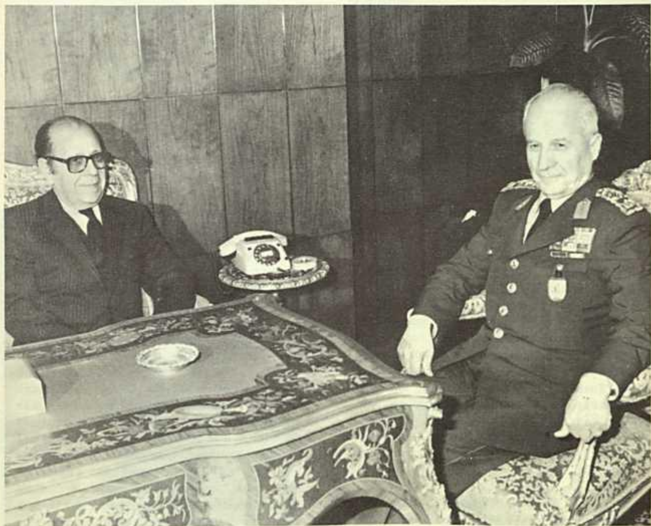
H.E. Mr. Habib Chatty, Secretary General of the O.I.C., in audience with H.E. General Kenan Evren, President of Republic of Turkey, during his last visit to Turkey.