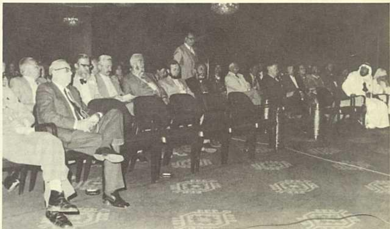
Another working session in progress. A view of the distinguished participants.