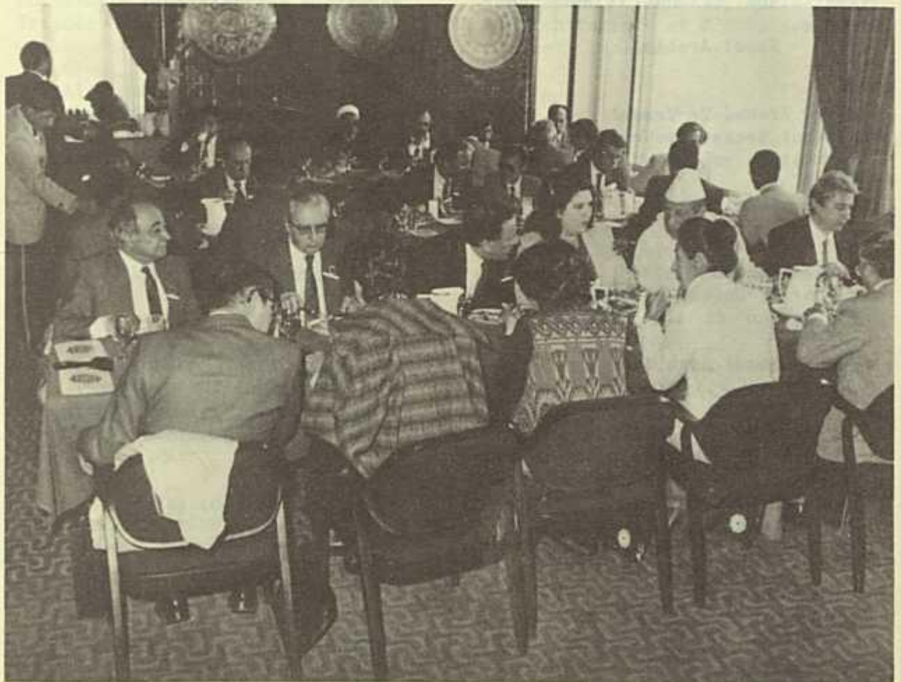
The delegates and participants to the Symposium during a meal.