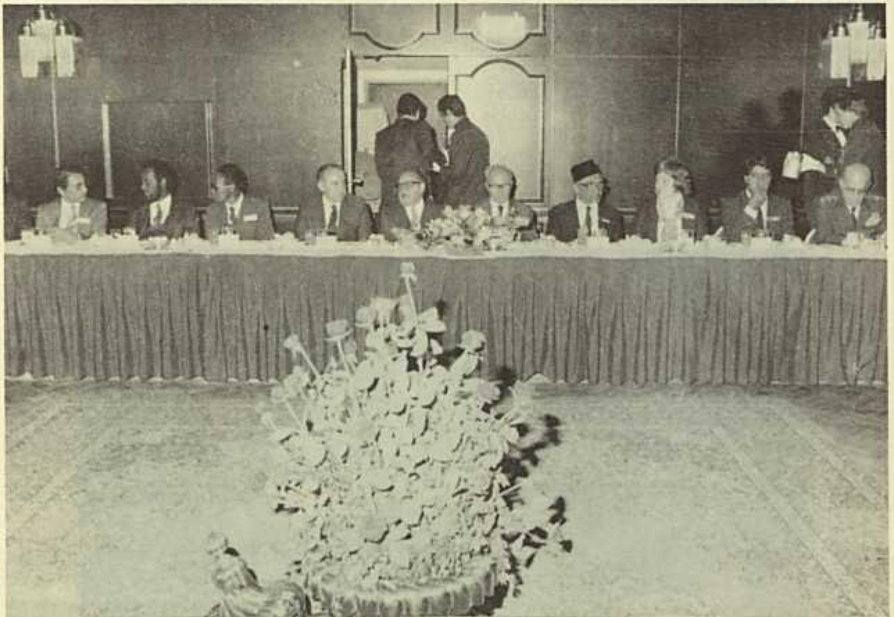
A group photo taken on the occasion of the lunch hosted by H.E. Mr. Bülend Ulusu, Prime Minister of Turkey, in honour of the visiting Ministers of Culture of Islamic Countries and other delegates.

The first piece was composed by Sultan Abdulaziz, in whose reign "Çit Qasr" was completed. The second was consisted of classical Tunisian music. This concert was very much appreciated by the audience.