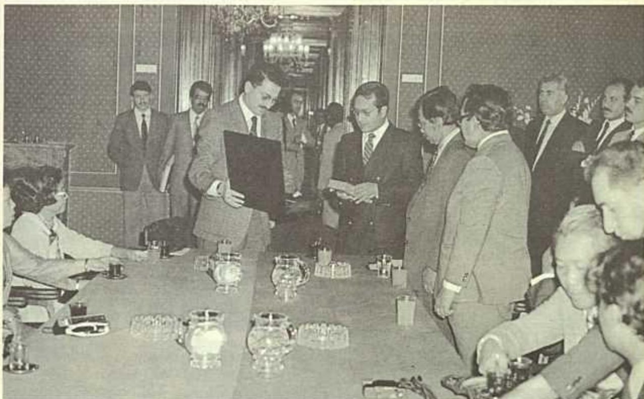
H.E. Dr. Mahatir Bin Mohammad, Prime Minister of Malaysia at the Centre. Dr. Ekmeleddin İhsanoğlu, Director General, presenting a souvenir to the Prime Minister.

H.E. Dr. Mahatir Bin Mohammad, Prime Minister of Malaysia visited the Centre on 15 May 1983. He remained in the Centre for quite sometime and was briefed by the Director General about the activities of the Centre and the ongoing research projects. He was also taken around various research departments where he asked searching questions to the researchers at work. He also visited the library where he was shown the rare books collection and copies of Quran in various languages of the world, including Malay. He praised the restoration work underway of the "Cit Qasr" -new premises of the Centre. He also presented a beautiful calligraphy work to the Centre. It was made of "Songket" -a traditional Malaysian hand-woven fabric.