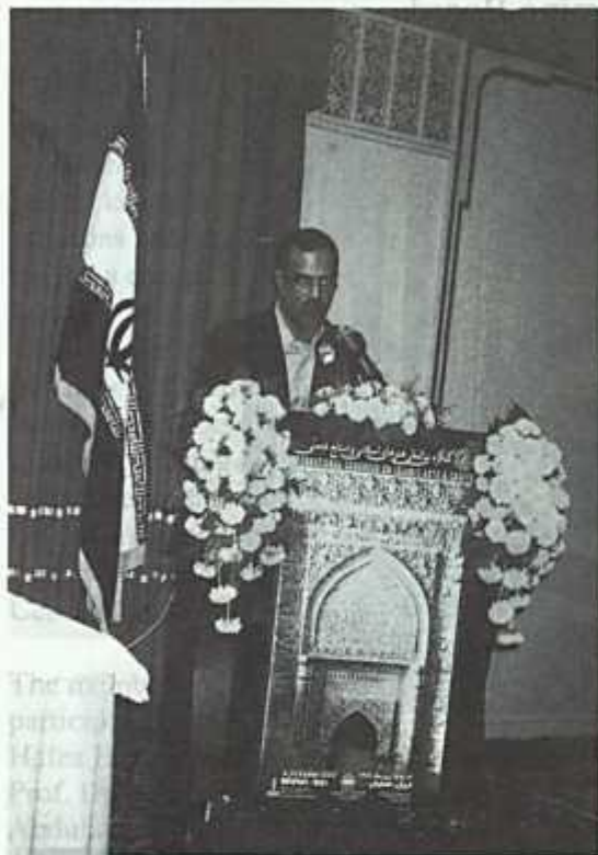
H.E. Mr. Ahmad Masjed Jamee, Minister of Culture and Islamic Guidance of Iran

IRCICA and the Ministry of Culture and Islamic Guidance/Organisation of Culture and Islamic Relations, Islamic Republic of Iran, have jointly organized the International Congress on Islamic Arts and Crafts, in Isfahan, on 4-9 October 2002. The Congress tried to highlight Islamic culture through its arts and crafts by pointing out their beauty and value. In addition, it suggested ways and means to create favorable conditions for artists and crafts people, conditions which are critical in encouraging them to continue their skills and to transfer them to the next generations. It is essential both for the preservation and the continuity of the cultural heritage of the Islamic world. The Congress deliberated on the challenges relating to design and methods used, technical cooperation and developing skills, exchange of techniques practiced, improvement of the quality of production, education and training of skilled artisans, financing, economy, marketing and the obstacles encountered, patronage and national policies. The Congress aimed to promote and assist the creation of an awareness of Islamic arts and crafts in the world. It provided a unique opportunity for raising interesting new approaches and possible solutions to some of the major problems facing the future of Islamic arts and crafts development. The event tried as much as possible to assess and determine the prospects of economic, social and cultural development of Islamic arts and crafts in various regions.