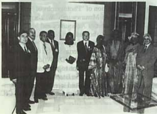
A souvenir picture of those present at the ceremony H.E. the Secretary General of OIC (first at right), H.E. the Vice-Chairperson of the Parliament (fourth at right), H.E. the Minister of Environment and Land Development (sixth at right), H.E. the Ambassador of Turkey in Dakar (third at left), H.E. the First Counsellor of the Embassy of Senegal in Riyadh (fourth at left)