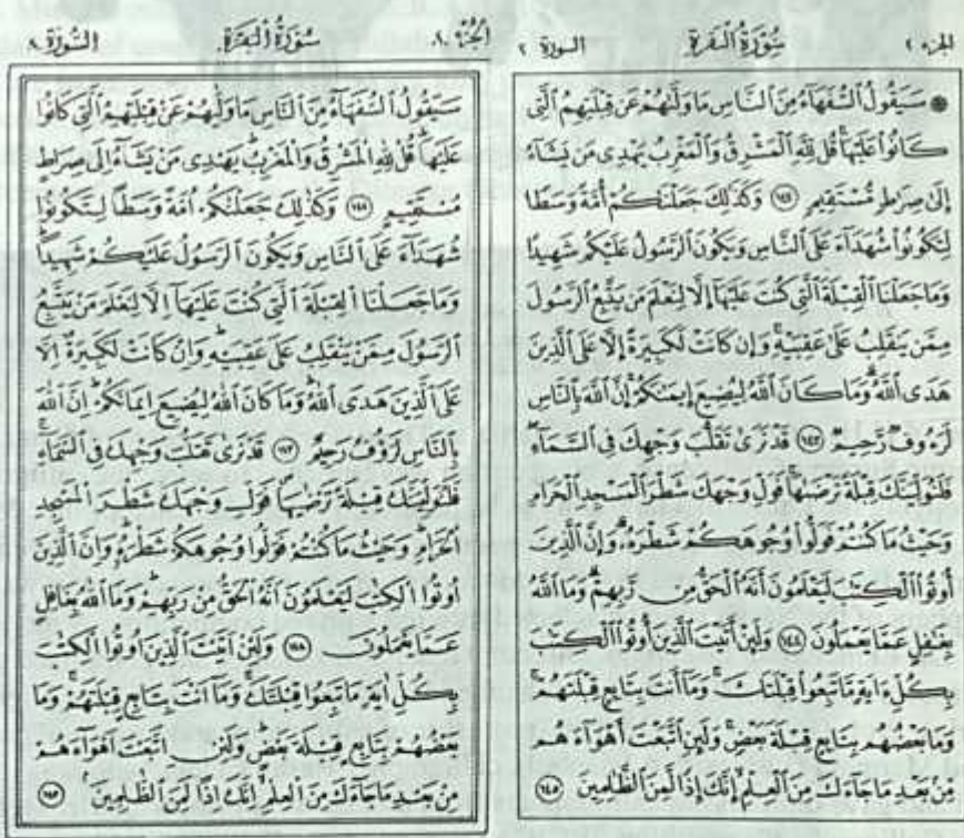
Samples of the winners' calligraphies