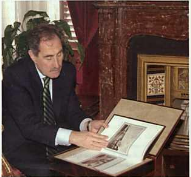
The Minister saw the album of historical photographs of Istanbul published recently

H.E. Mr. Ertuğrul Günay expressed his appreciation of the variety of important projects undertaken by the Centre. He reaffirmed the continuous support of the Government of Turkey to IRCICA.