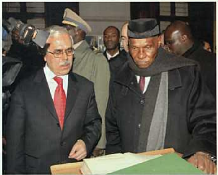
The President saw samples of rare books on Islamic culture preserved in IRCICA's library