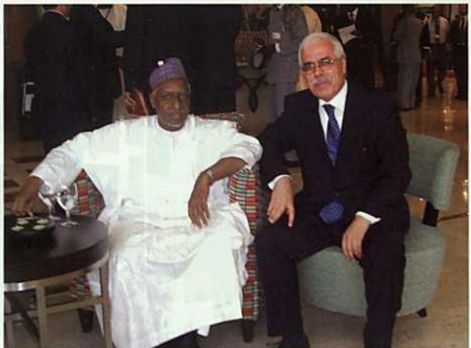
H.E. Dr. Hamid Algabid received information on the Centre's on-going activities