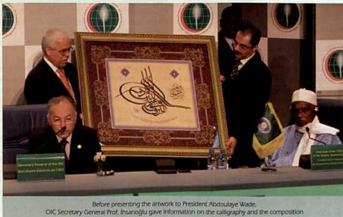
Before presenting the artwork to President Abdoulaye Wade, OIC Secretary General Prof. Ihsanoğlu gave information on the calligraphy and the composition

During its working sessions, the Summit Conference discussed and took resolutions on the main issues outlined below (texts extracted from the Final Communiqué of the Conference).