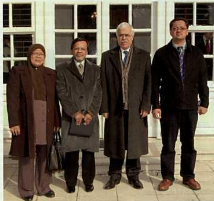
Souvenir photo in front of Çit Oasr, Yıldız Palace