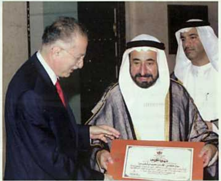
H.H. Sheikh Dr. al-Qassimi honoured Prof. İhsanoğlu for his outstanding contributions towards promoting the art of calligraphy

Sharjah biennial has a distinctive feature as compared to other international art events in that it is devoted exclusively to the art of calligraphy.