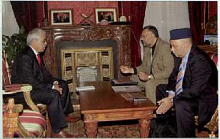
Meeting in the office of the Director General