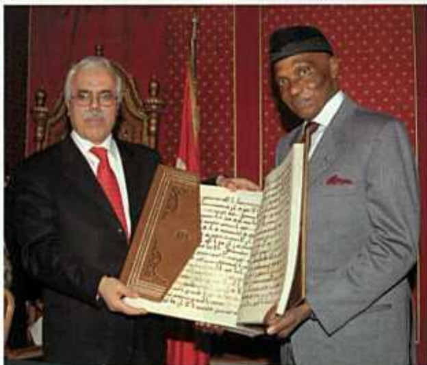
A facsimile edition of the Quran copy dating from the period of Caliph Othman was offered to President Wade

President Wade recorded His impressions in the Centre's Book, as follows (original in French): "I am filled with emotion as I visit this famous Islamic research centre directed until recently by the Secretary General of the OIC, Prof. Ekmeleddin İhsanoğlu. The Centre maintains close relations with Senegal, of which one of the sons has a seat on the Governing Board. Also, the Centre will make an exhibition in Dakar during the OIC Summit on 13-14 March 2008. I wish to develop the relations of the University of Dakar and especially the Regional Centre for Scientific Research that I am in the process of setting up in Dakar, with the Centre. I thank the Head of the Centre and warmly congratulate the researchers."