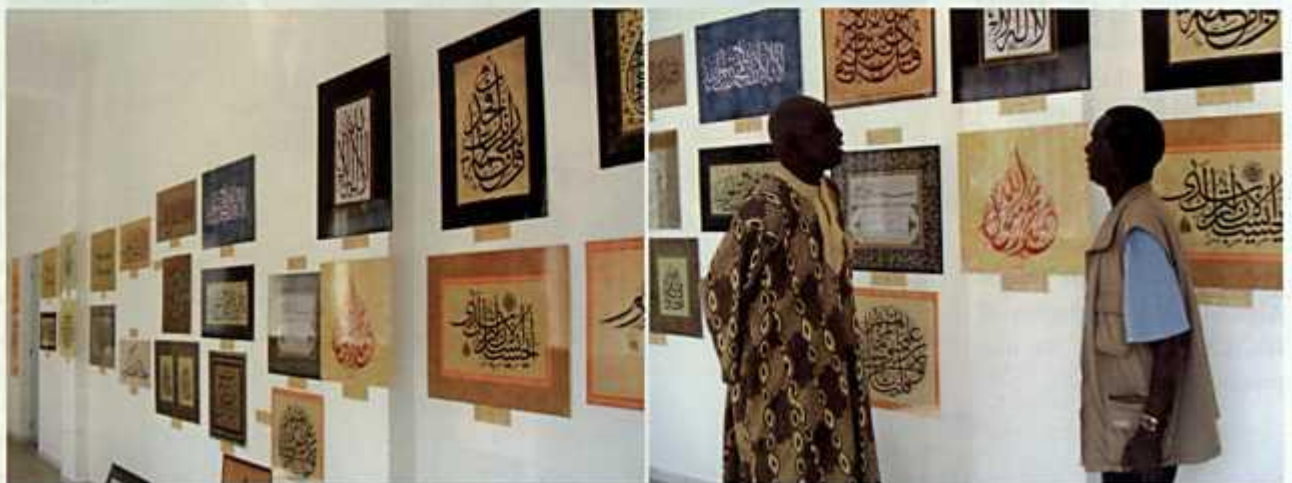
IRCICA's exhibition at the Museum of African Arts on the occasion of the Summit Conference

On the occasion of the Summit Conference, a large-scale Exhibition titled "The Sacred Book, the Islamic Arts and Manuscripts" was held at the Museum of African Arts of the "Institut Fondamental de l'Afrique Noire" (IFAN), located at Soweto Square, near the National Assembly building. The exhibition was opened by H.E. Maitre Abdoulaye Wade, President of Senegal, on Saturday 15 March, after the closing of the Summit Conference. It comprised copies of the Quran, other calligraphic works, archeological objects, costumes, carpets, etc. representing the arts and the cultural heritage of the Muslim world. The exhibits were contributed by various Member States, IRCICA, Institut du Monde Arabe (Paris) and Senegalese institutions and artists. IRCICA's gallery presented award-winner calligraphies of the competitions organised by IRCICA, written by artists from various countries, together with illustrations highlighting some long-term programs of the Centre relating to the artistic and architectural heritage of the Muslim world, in particular the Islamic heritage of Al-Quds. The exhibition drew a large number of visitors and was praised highly by the press.