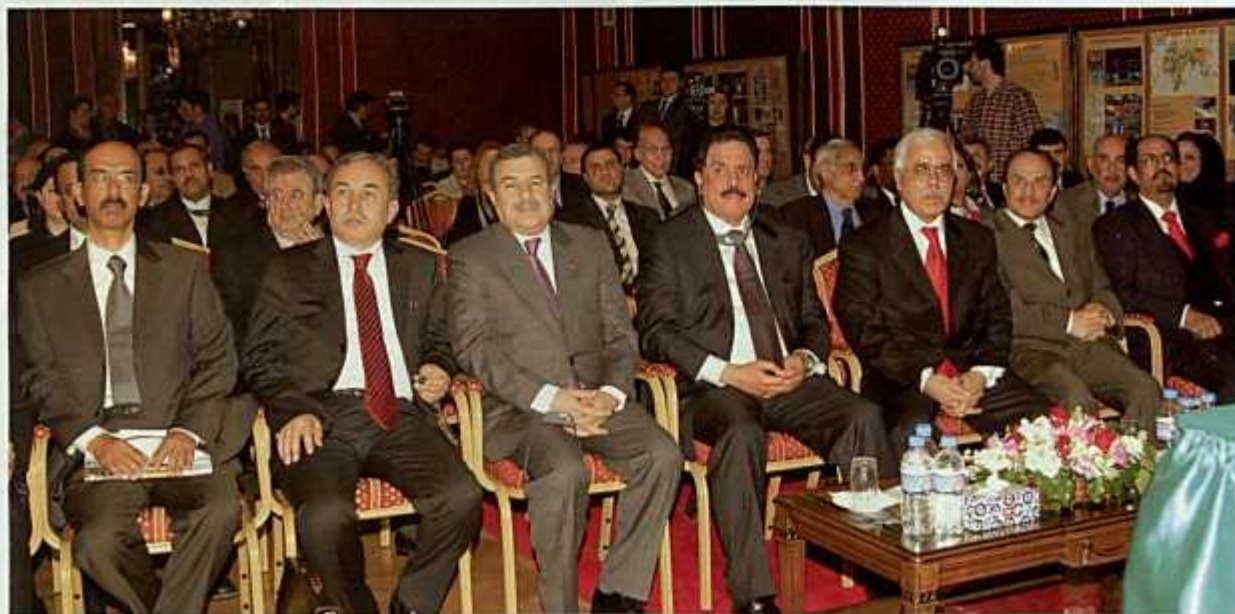
The opening ceremony at Çit Ocağı, Yıldız Palace