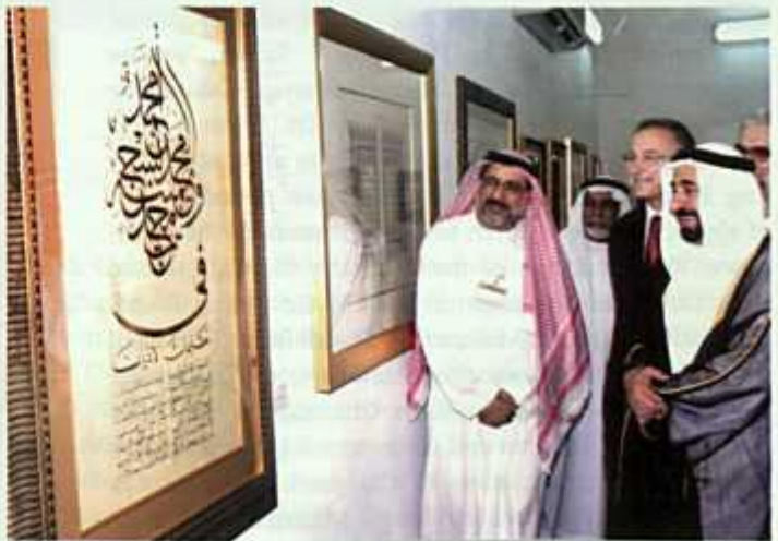
H.H. Sheikh Dr. al-Qassimi and OIC Secretary General Prof. İhsanoğlu visited the exhibition