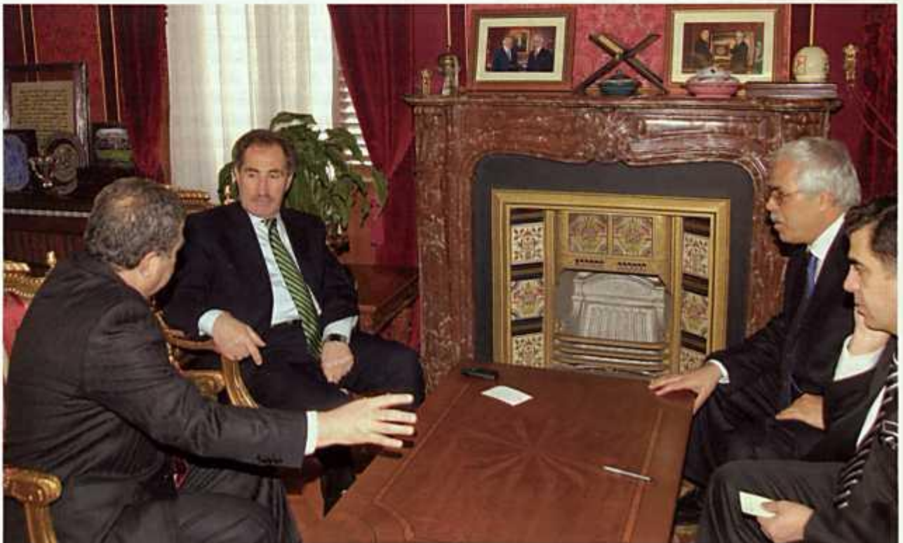
On this first visit to IRCICA, the Minister was briefed on the activities of the Centre.