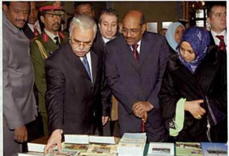
An exhibition of books relating to The Sudan selected from IRCICA Library and books published by IRCICA was prepared on the occasion of the President's visit

IRCICA was most honoured to receive at its Headquarters H.E. Omar Hassan Ahmed al-Bashir, President of the Republic of The Sudan, and the accompanying governmental delegation, during the period of the President's State visit to Turkey as the guest of H.E. Dr. Abdullah Gül, President of Turkey. This was the first Presidential visit to IRCICA from The Sudan. His Excellency Al-Bashir was already acquainted with IRCICA's activities through the reports and documents submitted by IRCICA to the Summit Conferences, but this was an excellent opportunity to give the President first-hand information on IRCICA's researches and present its publications. The President and His entourage were accompanied by Mr. Mehdi Eker, Minister of Agriculture and Rural Affairs of Turkey.