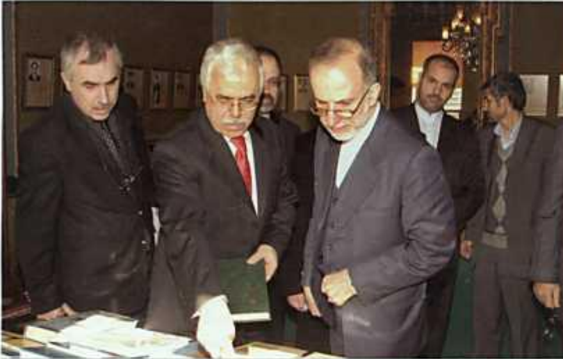
Samples of books on Iran chosen from IRCICA Library