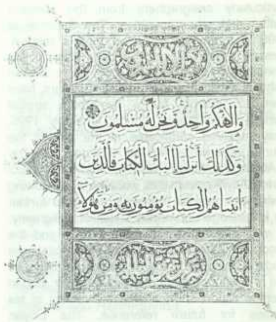
From the collection: a page of the Quran, Egypt, 14th century

Fort Worth, Texas; Atlanta, Georgia; Scottsdale, Arizona; Richmond, Virginia; St. Louis, Missouri; and then on in the Canadian Museum of Civilisations in Hull, Quebec, and finally in the New Orleans Museum of Art in Louisiana.