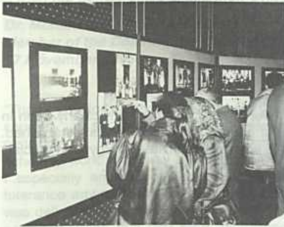
Exhibition on the Darulaceze