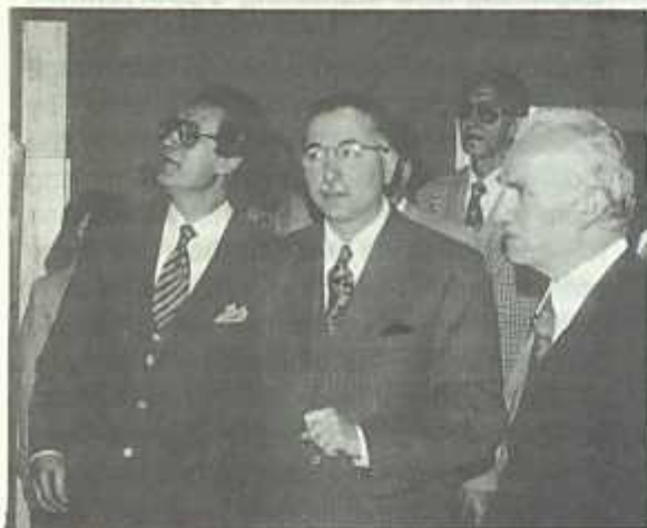
H.E. the Minister of Culture of Egypt, IRCICA Director General, and H.E. the Ambassador of Turkey to Egypt at the exhibitions (from left to right)