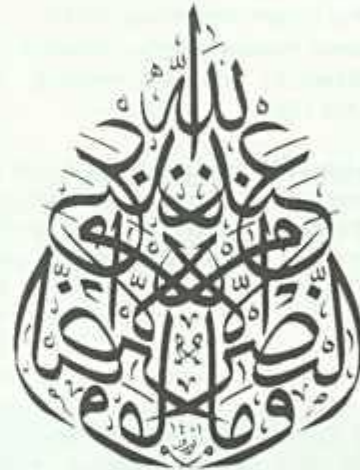
A calligraphy by Yusuf Zunnun

Zunnun communicated his own findings according to which pre-Islamic Arabic script was an invention inspired from the Hadari script, which, in turn, had its origin in a script that was widespread in the Jezira region from the second century B.C. to the third century A.D. Prof. Zunnun examined the inscriptions found in Hadar, which was the capital city of the Hadaris and is located 110 kms. south to the city of Musul. He compared the Hadari script with the Arabic script to pinpoint their differences and similarities; the major similarity between the two scripts is the linking together of letters.