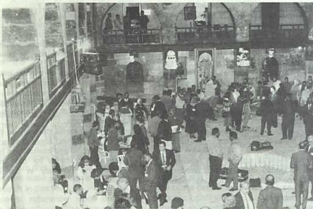
The participants visiting artisans' workshops