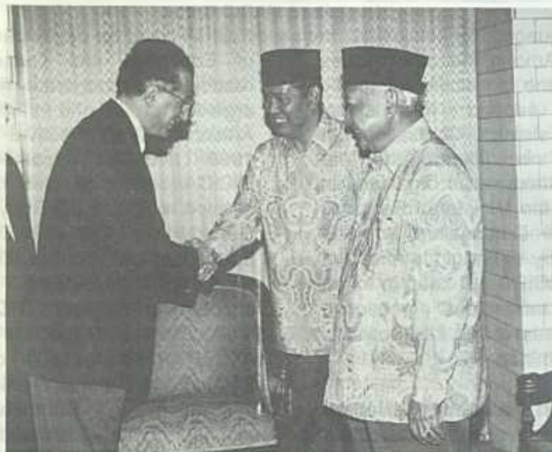
President Soeharto received IRCICA Director General, Vice-President H.E. Mr. Try Sutrisno shaking hands with the Director General

Upon the invitation of H.E. Dr. Tarmizi Taher, Minister of Religious Affairs, Republic of Indonesia, IRCICA participated in the Second Istiqlal Festival held from 23 September-23 November 1995. The major aim of the Festival is to develop a positive image of Islam through a set of activities including seminars, a film festival, folklore performances, crafts exhibitions, traditional and contemporary arts, and displays of old Mushafs, manuscripts, books, and other artifacts.