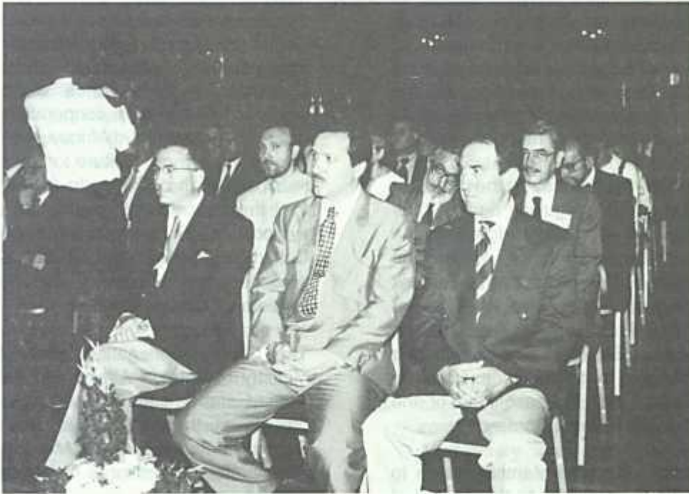
View of the audience at the opening ceremony. In the middle, Metropolitan Mayor of Istanbul Mr. R.T. Erdoğan

The workshop program titled Architectural Heritage Today was organised by IRCICA with the cooperation of the Metropolitan Municipality of Greater Istanbul, with institutional support from around the world. 158 architects and professionals participated in the workshop, from thirty-nine universities in nineteen countries. The workshop took place from 1st July-18 August 1995, at IRCICA, as well as at the Yıldız Technical University (Istanbul) and other universities. It was held in two stages comprising sixty-four lectures and 156 hours of studio work in total. The first stage was on the restoration and preservation of Istanbul and the Süleymaniye Area (1st-27 July 1995); the second stage (24 July-18 August 1995) was the second pilot workshop Mostar 2004.