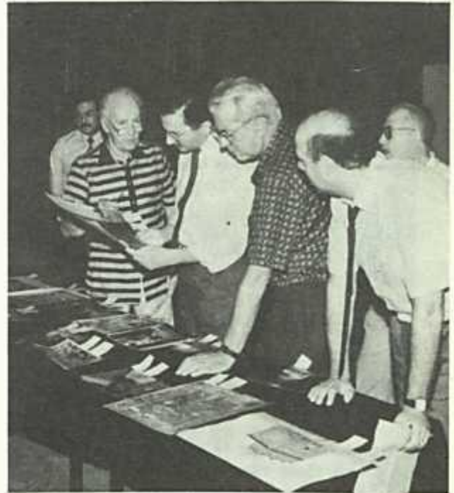
The Jury extensively discussed on the entries

A total of 229 photographers participated in the competition, from the following 36 countries: Algeria, Bahrain, Brunei Darussalam, Belgium, Canada, People's Republic of China, Czechoslovakia, Egypt, France, India, Indonesia, Iraq, Iran, Italy, Jordan, Malaysia, Mali, Morocco, the Netherlands, New Zealand, Oman, Pakistan, Poland, Portugal, Qatar, Saudi Arabia, Sierra Leone, Switzerland, Syria, Tunisia, Turkey, the Union of Soviet Socialist Republics, the United Arab Emirates, United Kingdom, the United States of America and Yugoslavia.