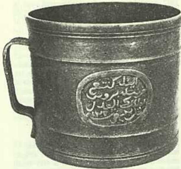
An old brass measure from the Museum's collection

* Gallery 5 houses the fine art collection, consisting of porcelains and stoneware dating back over thirteen centuries.