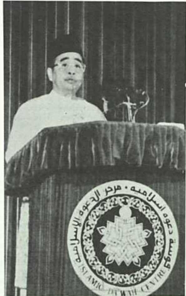
Minister of Religious Affairs H.E. Pehin Dato Dr. Haji Mohd. Zain bin Haji Serudin gives the Inaugural Speech

H.E. Dr. Hamid Algabid, Secretary General of the OIC thanked His Majesty the Sultan and Yang Di Pertuan, Negara Brunei Darussalam for having graciously agreed to patron the seminar. The Secretary General of the OIC emphasized and expressed appreciation of the exemplary cooperation established between Brunei