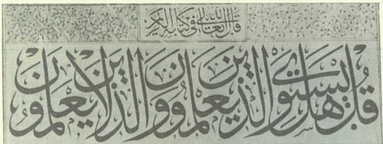
Djali thuluth calligraphy by Aziz Efendi

IRCICA's programme of Saturday lectures for the near future include the following themes: