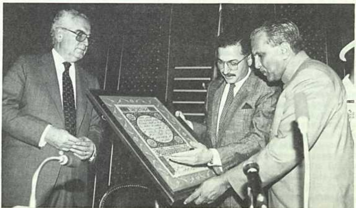
A Hilya presented to H.E. Zia ul Haq