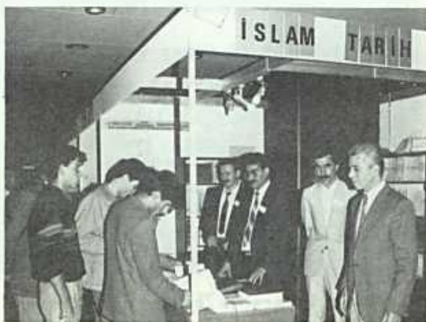
IRCICA's stand at Istanbul Book Fair

IRCICA's publications were displayed at a large-scale book fair organised in Istanbul by the Turkish Ministry of Culture and Tourism. The fair was held between 16-25 October at Atatürk Cultural Centre; 130 publishers, booksellers and institutions participated in the fair with nearly 10 thousand books.