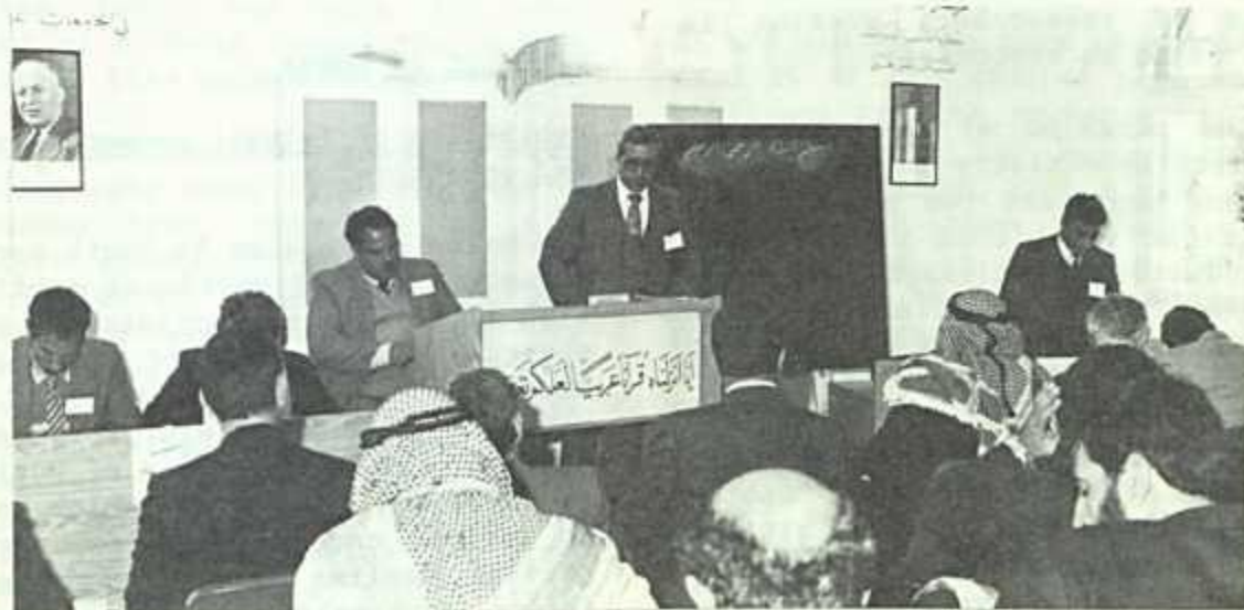
Conference at Al-Quds University

The Arab League Educational, Cultural and Scientific Organisation (ALECSO) collaborates with the Cultural Section of the P.L.O. to publish a series of books on the cities of Palestine, titled "The History of a City". Each of the 21 cities is devoted one volume in the series. The books give information about the history, geogra-