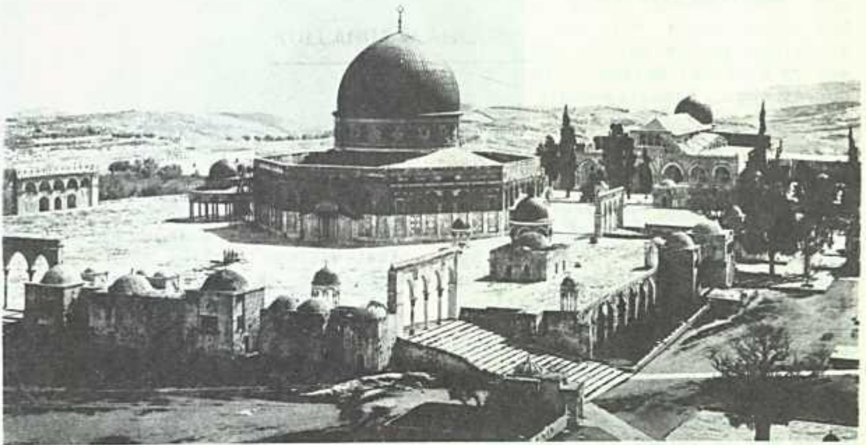
Al-Quds at the end of the 19th century

Al-Quds is the city of Al-Aqsa Mosque, the third Holy Mosque in Islam; of the Omar Mosque, the Dome of the Rock and many other historical monuments. Arabs settled in this land around the year three thousand B.C. Throughout history, people of Arab origin lived in this land under different names such as the Canaanites, Yabussis, Amorites, Moabites. This was an area of demographic attraction; during the uninterrupted presence of Arabs in the region, other peoples and tribes joined and were fused in their civilisation: Greeks, Persians, Romans, Byzantines and others. But Arab culture and civilisation always dominated over other cultures.