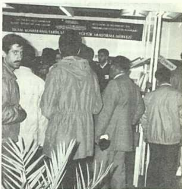
IRCICA's stand at Tehran Book Fair

IRCICA was invited to the First International Tehran Book Fair held on 3-13 November. A total of 106 publishers from 19 countries, 205 Iranian publishers and 3 international organisations participated in the fair. IRCICA's stand drew the attention of the visitors and especially the representatives of cultural institutions and university teachers. Contacts were made during the period of the fair to promote exchanges of books between IRCICA and Iranian libraries and research institutions.