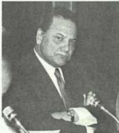
Justice Dr. Javed Iqbal

ed his Ph.D. in philosophy from Munich University in Germany and returned to London to study law, where he completed his Bar-at-Law. By that time, Iqbal had won a fame and popularity in literary circles with his writings and lectures. Returning home in 1908, he was welcomed back enthusiastically. He practiced law but at the same time, he continued to write and lecture. It was in one of the meetings of Anjuman-i Himayat-i-Islam (Council for the protection of Islam) in Lahore that the first read his famous Shekwa (The Complaint), which was followed, one year later, by the Jawab-i-Shekwa (Answer to the Complaint).