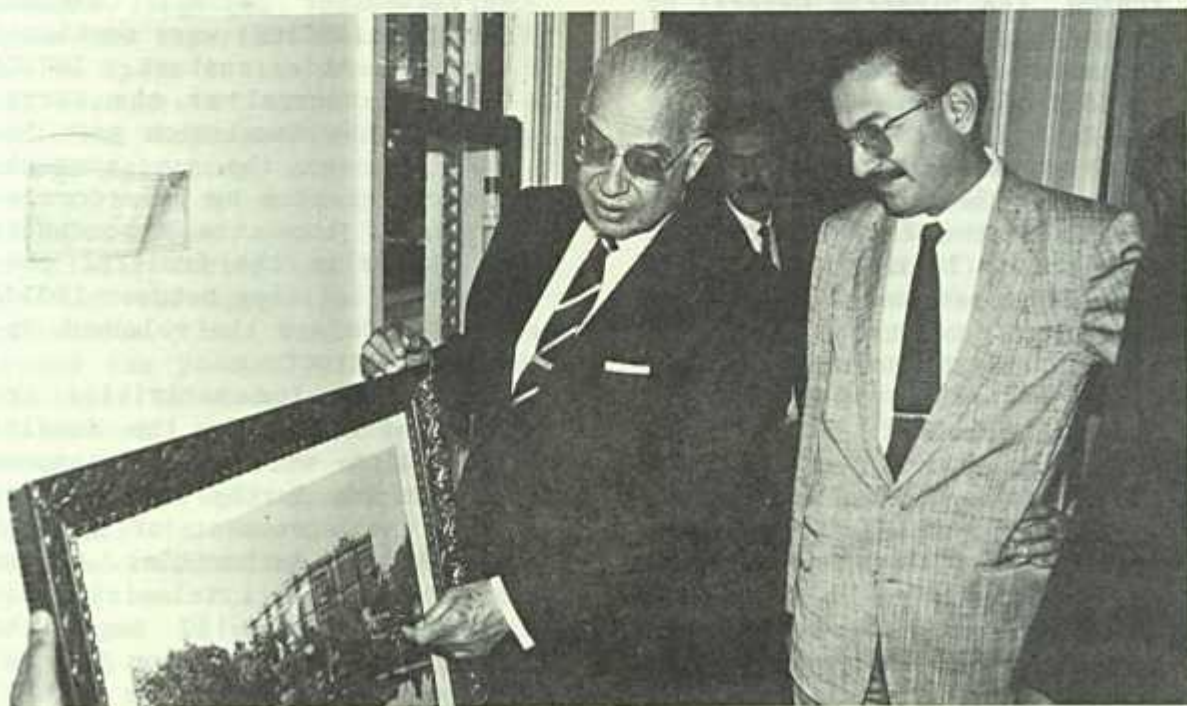
The Centre had the pleasure to present to H.E. Dr. Ismet Abdul-Majid a photograph from the Centre's archives showing the Ministry of Foreign Affairs of Egypt early in this century

"It is a great pleasure to visit the Centre today. This is a monumental Islamic establishment worthy of esteem. We are proud of all its books and manuscripts and the abundant and beautiful scholarly material it contains. I thank God Almighty and wish continuous success to Dr. Ekmeleddin " (translation).