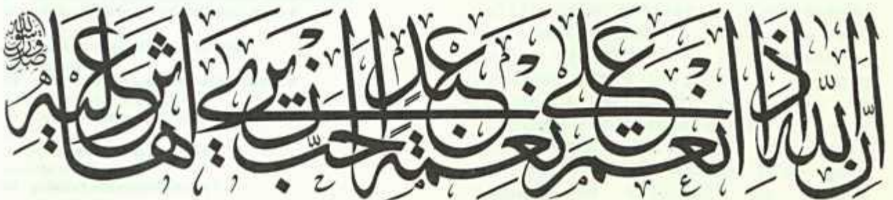
Thuluth-Nasih calligraphy by Hüseyin Öksüz, Turkey (2nd mention)