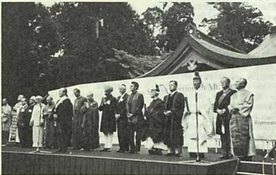
Representatives of different religions

As I pointed out in my paper "Islam and Peace", one can hardly claim that the history of religions has no examples of mischief on record, but we believe that these were committed against the essence and spirit of religions, their real purpose being dissembled under the mantle of religion. We are all convinced that the existing measures for world peace would gain much from a theoretical and practical action programme that would derive its essence from the fundamental teachings of religions. A necessary condition for the success of such collaboration among religions is that an agreement on the principles be reached. On the basis of such an agreement, the methods and procedures that are relevant in the context of each religion can be set to work. One of these principles is, according to me, that we all agree on the idea that we