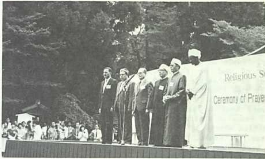
The Muslim delegation

have gathered here not to preach or teach but to learn more about each other. A second issue which we must agree upon is that it would not be an easy task to overcome in a short time the misunderstandings accumulated and established in different parts of the world throughout the centuries. Third, we all do know that cooperation among us is not meant to entail concessions from our own beliefs and we should make our people aware of this fact. Finally, a sincere desire shared by all of us is to agree on a common ground which, I believe, is vast and wide, and we must always emphasize our common aspiration for world peace. I would like to conclude by greeting you with a prayer from the Holy Quran: "O Believers, enter the peace, all of you".