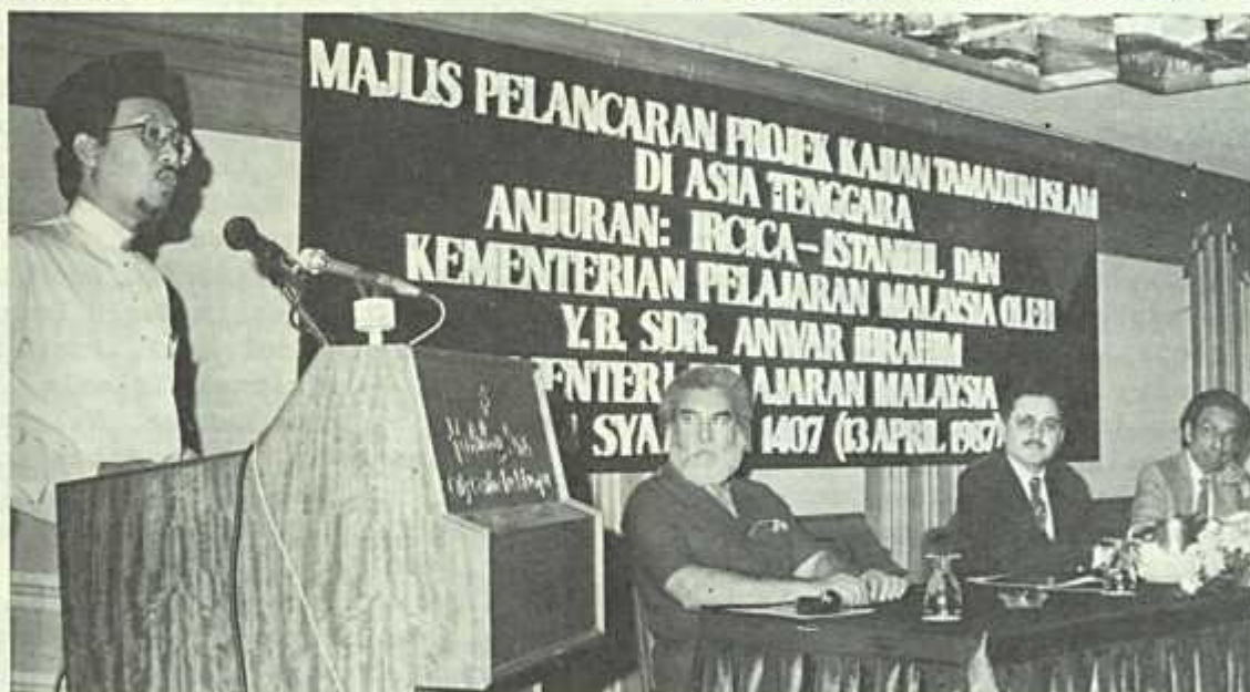
Inauguration by H.E. the Minister of Education, Malaysia

The meeting was inaugurated by the Hon. Anwar Ibrahim, Minister of Education of Malaysia. In his speech, the Minister welcomed re-