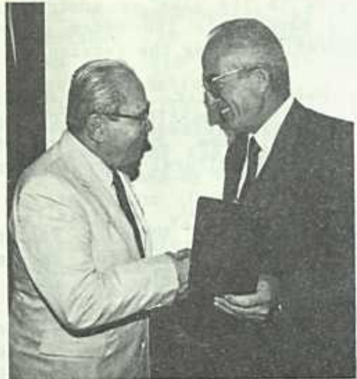
Prof.Dr.Halil İnalçık receives the plaque from H.E. the Governor of Istanbul

Then, the message sent by H.E. Syed Sharifuddin Pirzada, Secretary General of the OIC was read; the Secretary General could not attend the symposium because of previous engagements. He underlined the importance of the subject matter of the symposium and wished success to the participants. The keynote inaugural speech was given by Prof. Dr. Halil İnalçık from the Department of History of the University of Chicago, who focused on the relationship between culture and