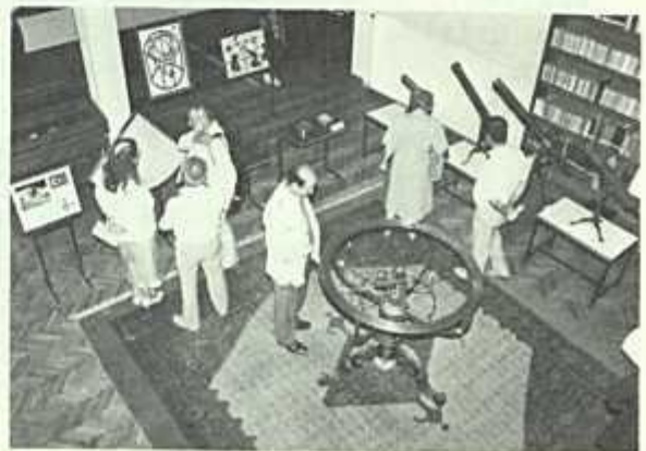
Exhibition at Kandilli Observatory

It was a pleasure for IRCICA to hear the participants expressing satisfaction and appreciation with respect to both the academic quality, usefulness and importance of the papers and discussions and the organisational aspects of the Symposium. Some said it had been beneficial in providing new insights into issues of common interest others pointed out that it had in created awareness among scholars, scientists and researchers working on various aspects of the history of science, about each other's work. The event was closely followed and reported by the Turkish radio and television and various press organs.