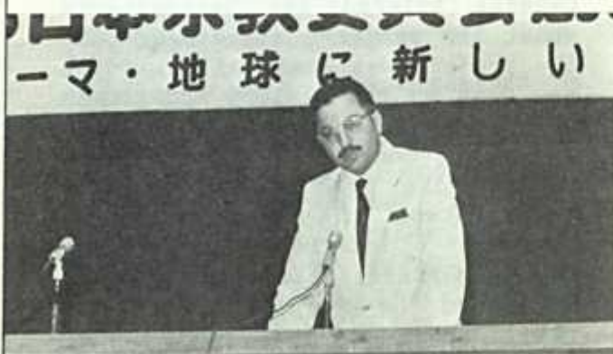
IRCICA Director General at the Summit

The Summit was inaugurated on 3rd August; IRCICA Director General was invited to deliver a speech on behalf of the Muslim delegation at the inauguration of the Summit. We reproduce below the main parts of this speech: