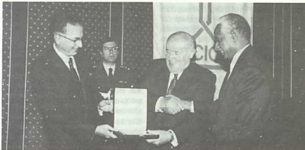
Presentation of a plaque of gratitude to H.E. Süleyman Demirel

refine the spirit of method and analysis, ease communication, stimulate sensitiveness and taste, and favor understanding and entente."