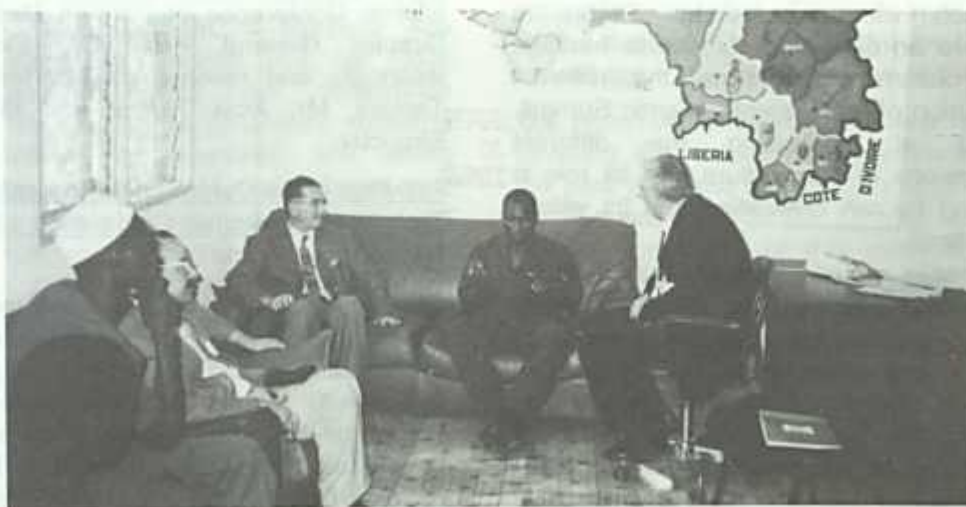
Visit of IRCICA delegation to the National Museum of Guinea