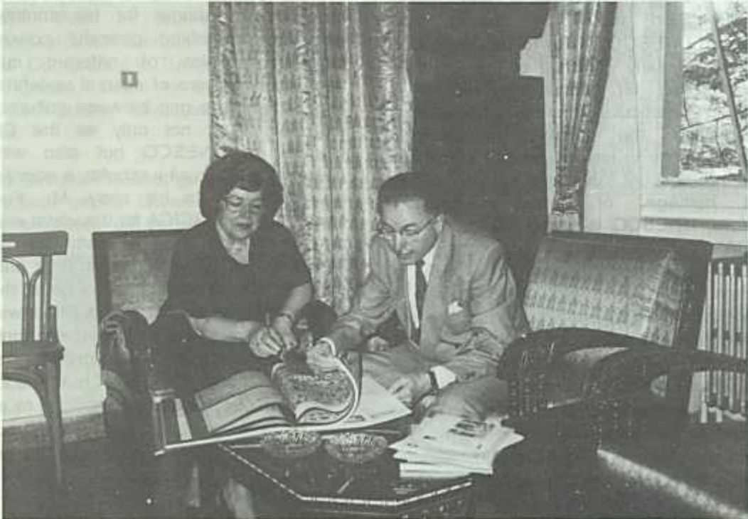
Meeting with H.E. Dr. Najah al-Attar, Minister of Culture, Syria